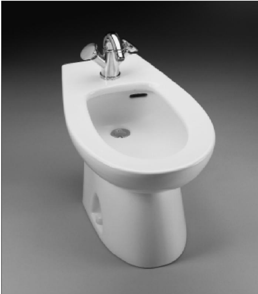
BT500A - Piedmont Bidet, Deck Mount