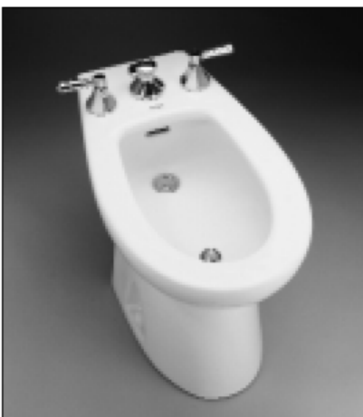
BT500B - Piedmont Bidet with vertical spray